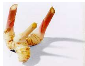
Kha (Galangal Root)