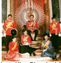
His Majesty King Bhumipol Aduladej