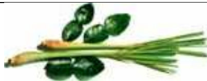
LEMON GRASS (TAKRAI)

If you are allergic or have a distaste for certain ingredients, please tell us at the time of ordering and we will try to accommodate your needs.